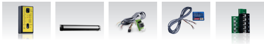
Spotfinder Rain Accessory Fire Door Adapter Multisensor hub Retrofit interface